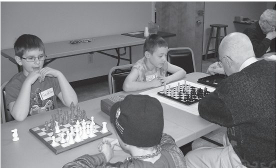
Another successful and fun Chess tournament at Encore. Everyone did great!